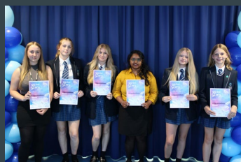
Social Sciences Award Winners