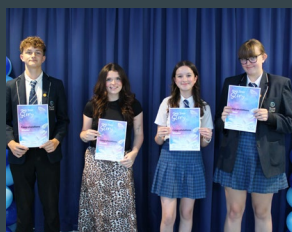
Mathematics Award Winners