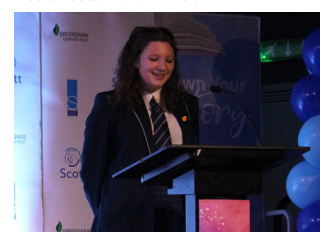
Poet Laureate, Isabelle