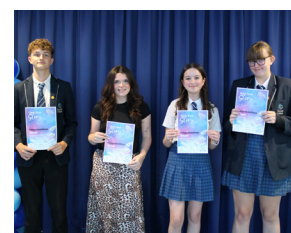
Mathematics Award Winners