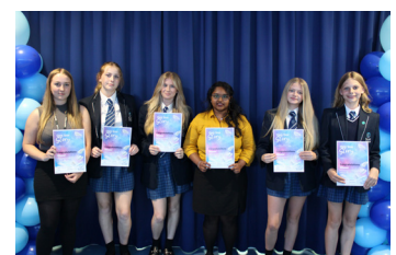
Social Sciences Award Winners