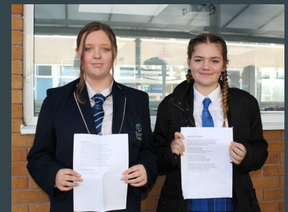
SMHC AND SDCC Poet Laurette