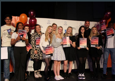
Sixth Form Award Winners