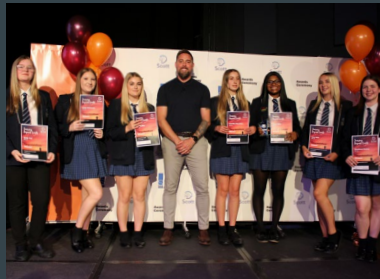
Special Award Winners