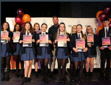
Year 9 Award Winners