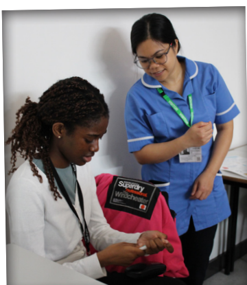
Medical Practical Skills Day