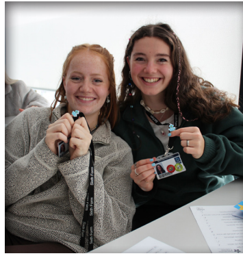
Dementia Friendly Training