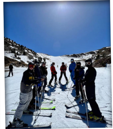
Ski Trip to Italy