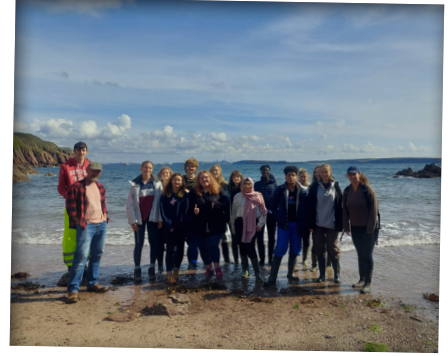
Biology Trip to Pembrokeshire