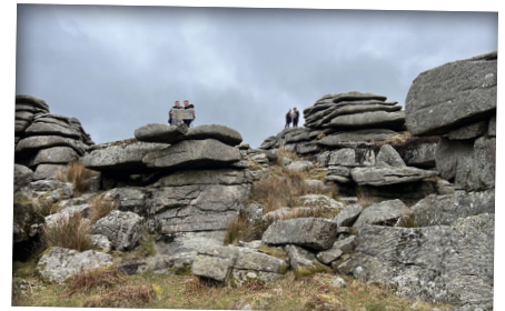
Gold Duke of Edinburgh