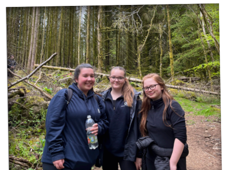
Gold Duke of Edinburgh