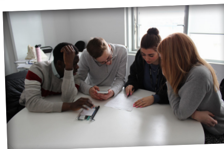
Budget and Finance Workshop