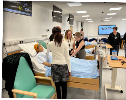
Marjon University Campus Tour