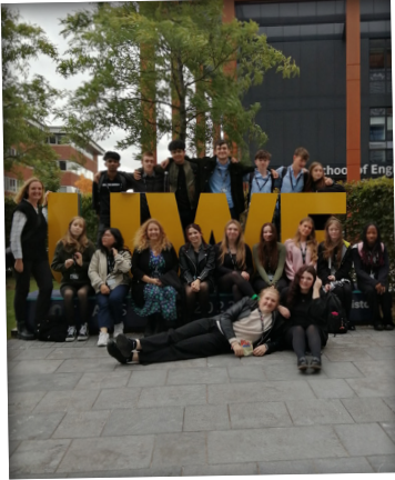
Visit to University of the West of England (UWE)